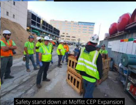
Safety stand down at Moffitt CEP Expansion