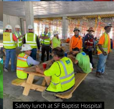
Safety lunch at SF Baptist Hospital