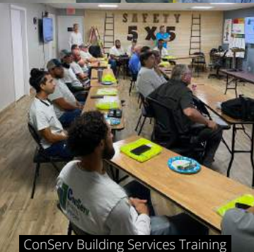
ConServ Building Services Training