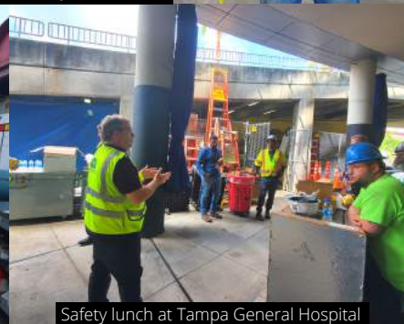
Safety lunch at Tampa General Hospital