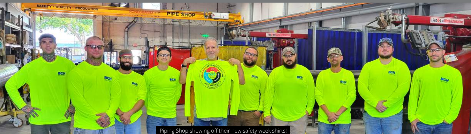
Piping Shop showing off their new safety week shirts!

Every day, we walk onto construction sites with one goal in mind - get the job done safely. We take great pride in the role we play shaping the communities in which we live, work and play. But even more than that, we feel an unwavering responsibility to one another, our families and friends, to make sure we all return home safe every day.