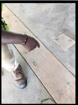
Plywood sitting on top of the 2x4 that was covering the seam.