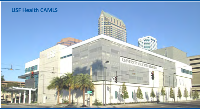
USF Health CAMLS