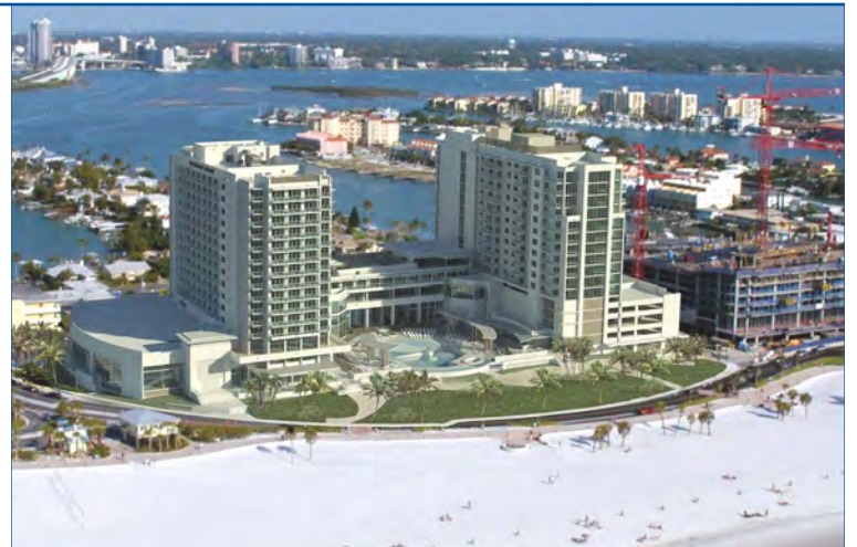
The Wyndham Grand Resort Clearwater Beach

BCH Mechanical was contracted by Moss & Associates to perform the mechanical scope for this project, which included two (2) 450-ton water cooled centrifugal chillers, three (3) high efficiency stainless steel cooling towers, three (3) high efficiency chilled water pumps and seven (7) high efficiency condenser water pumps, as the basis of the infrastructure.