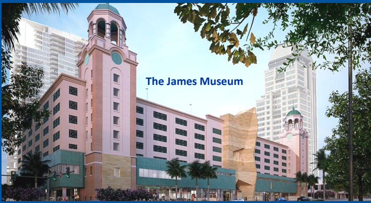
The James Museum